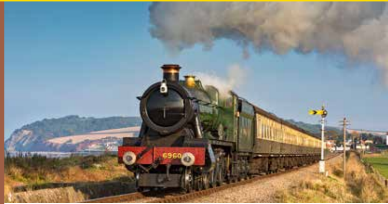
The West Somerset Railway reserves the right for operational, technical and any other reason to amend the published dates, timings, number of services, motive power and event dates.